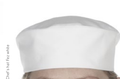
Chef's hat Fez white