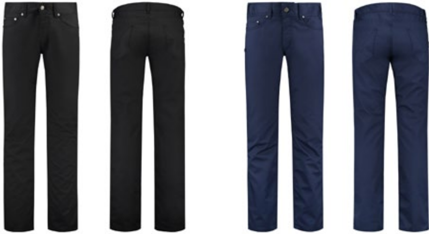
Kitchen pant Oregon