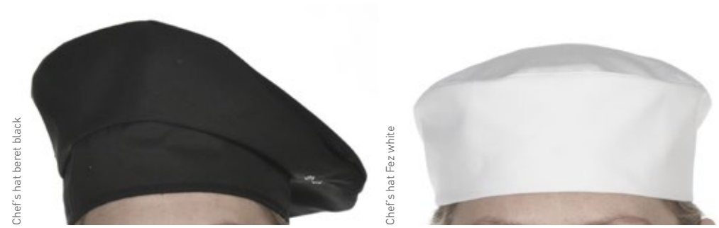
Chef's hat beret black