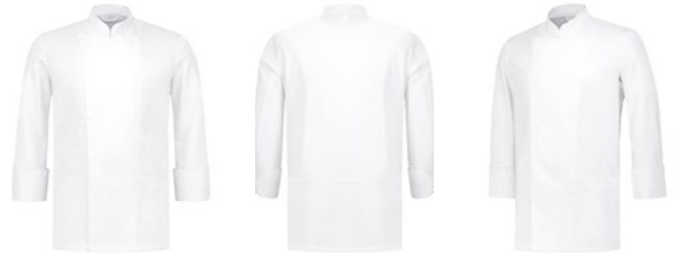
Chef's jacket Glasgow