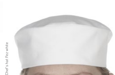
Chef's hat Fez white