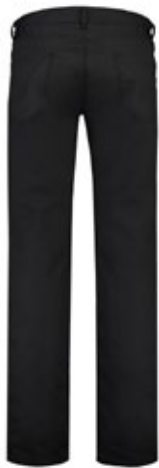
Kitchen pant Oregon