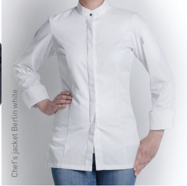
Chef's jacket Berlin white