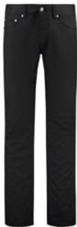
Kitchen pant Oregon