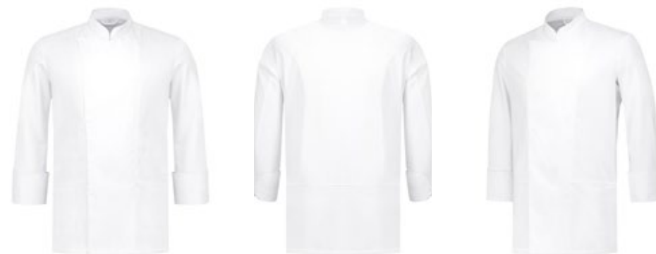
Chef's jacket Glasgow