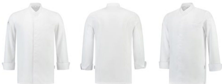
Chef's jacket Gusto