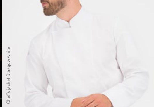
Chef's jacket Glasgow white