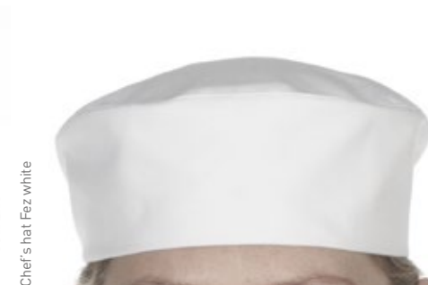
Chef's hat Fez white