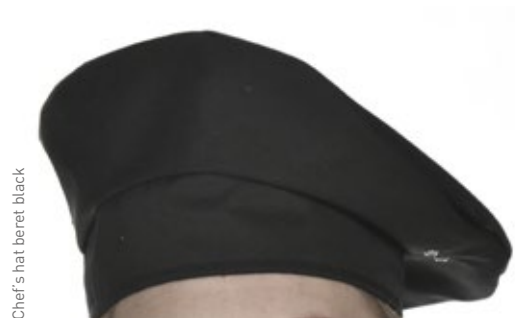
Chef's hat beret black