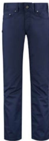
Kitchen pant Ontario